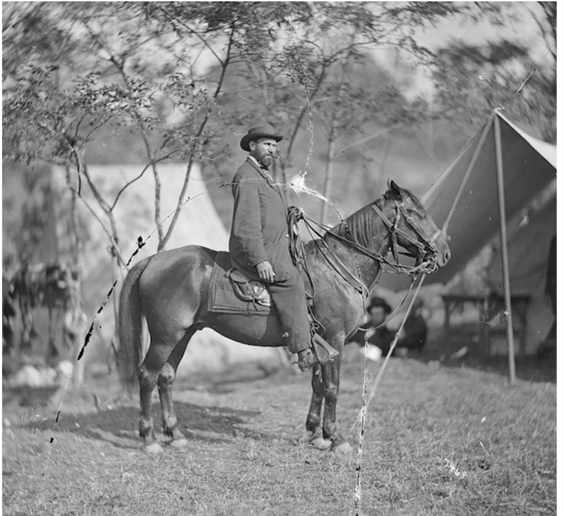
Allan Pinkerton was chief of intelligence for Union General George McClellan during the Civil War.