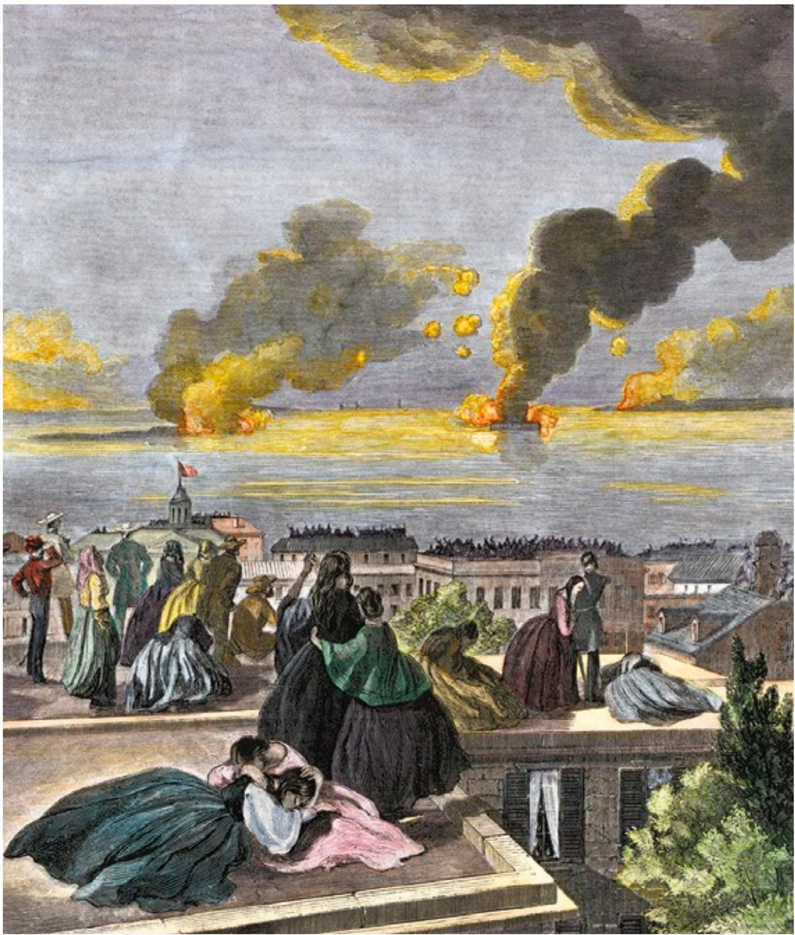
Citizens of Charleston, South Carolina, watch the Civil War begin on April 12, 1861, as Confederates fire on the Union's Fort Sumter.