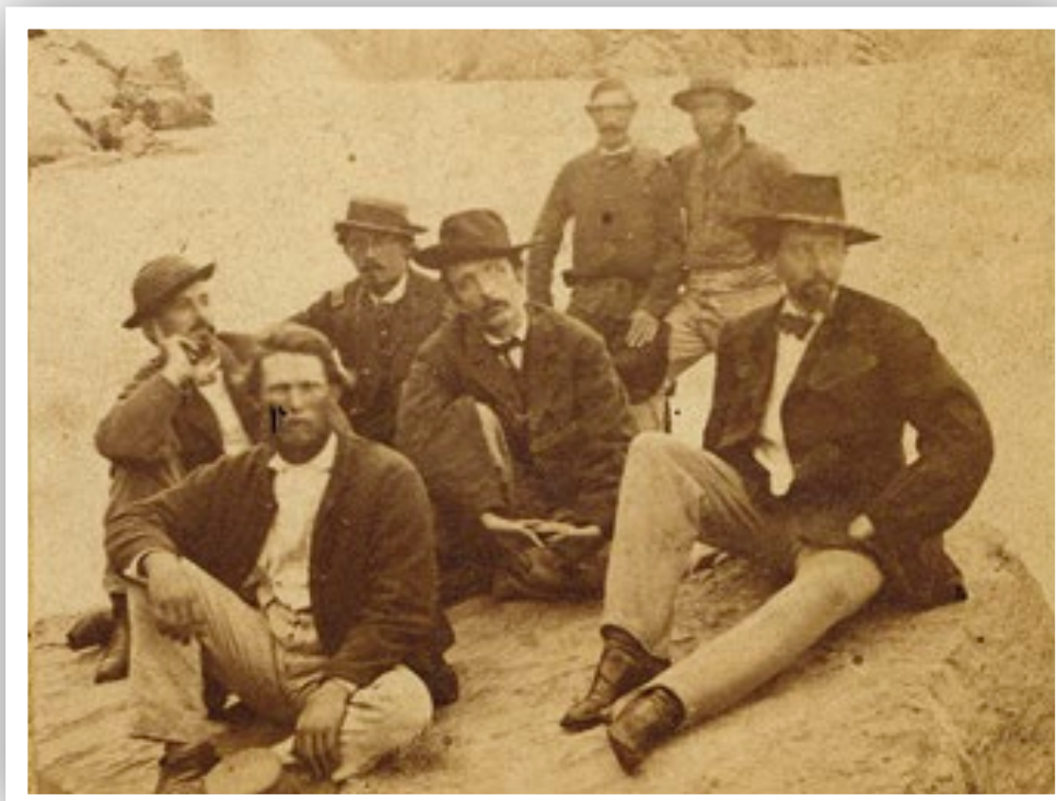
a group of Confederate Secret Service agents in Virginia

You realize that this would make you a double agent! Working for Johnson, you might be able to get even more important information for Pinkerton. But you will face extra pressure pretending to work for the Confederates.