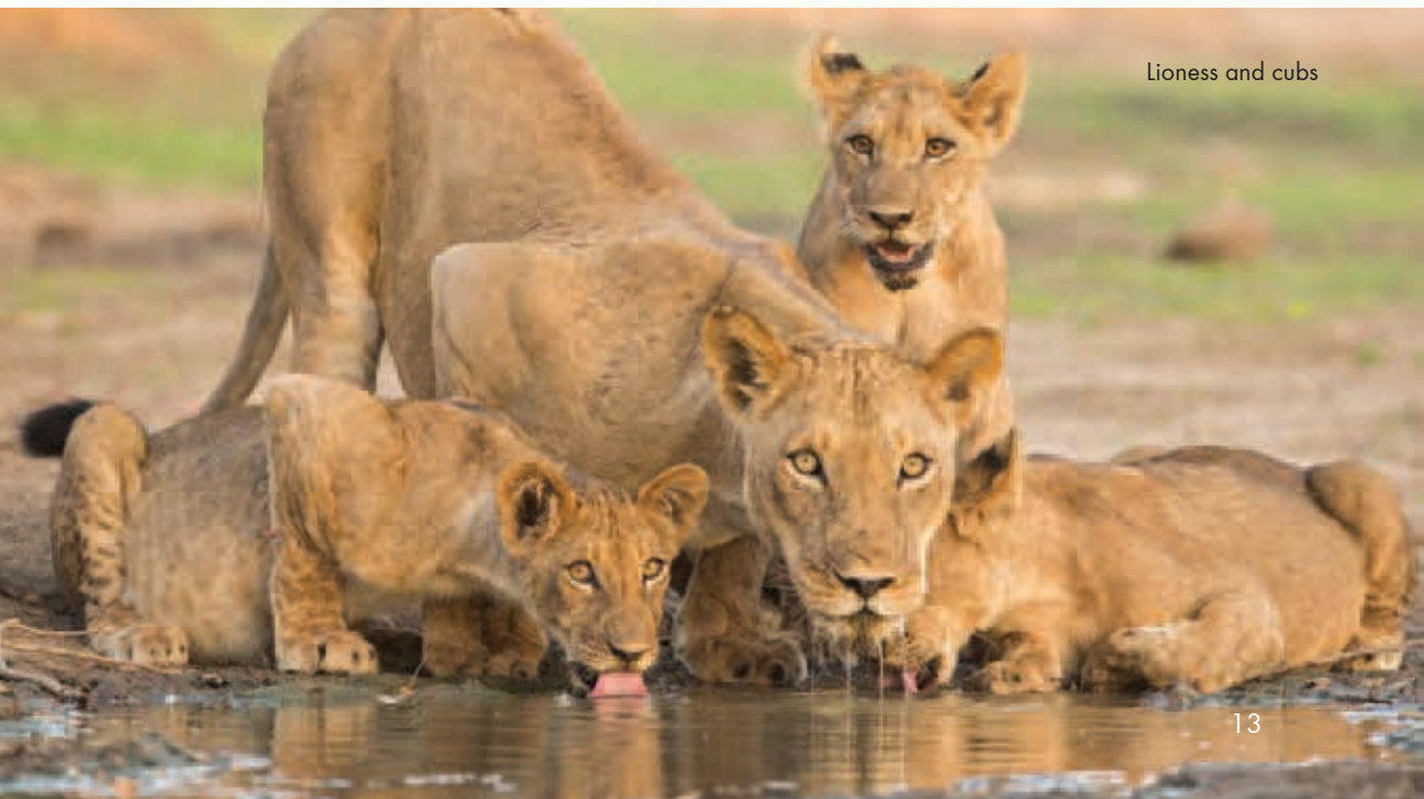
Lioness and cubs