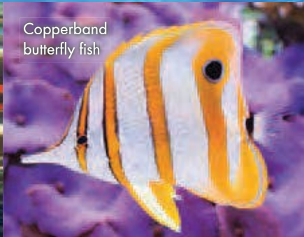
Copperband butterfly fish