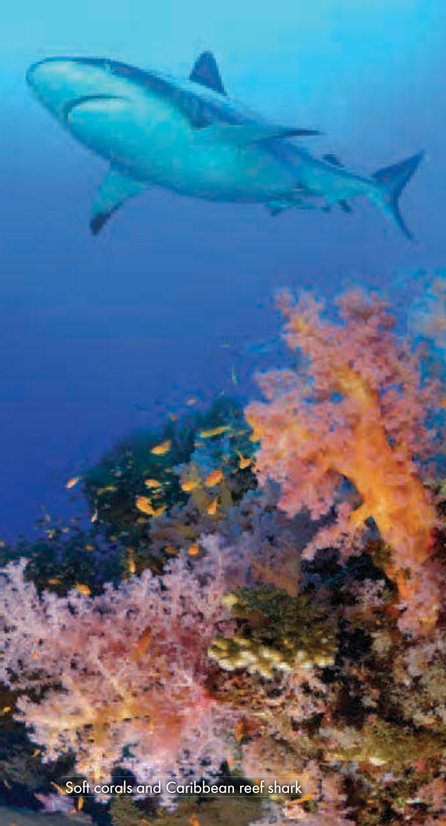
Soft corals and Caribbean reef shark