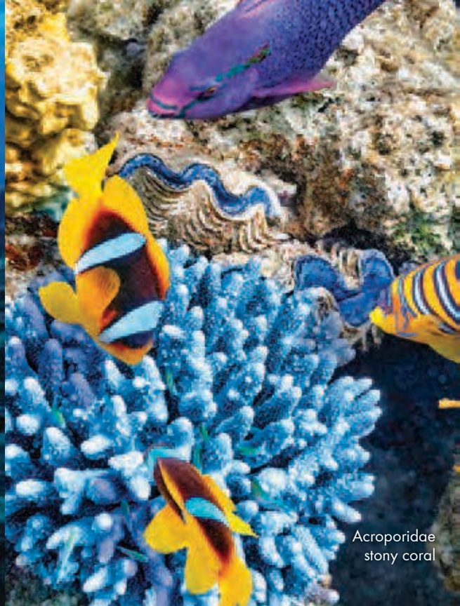
Acroporidae stony coral