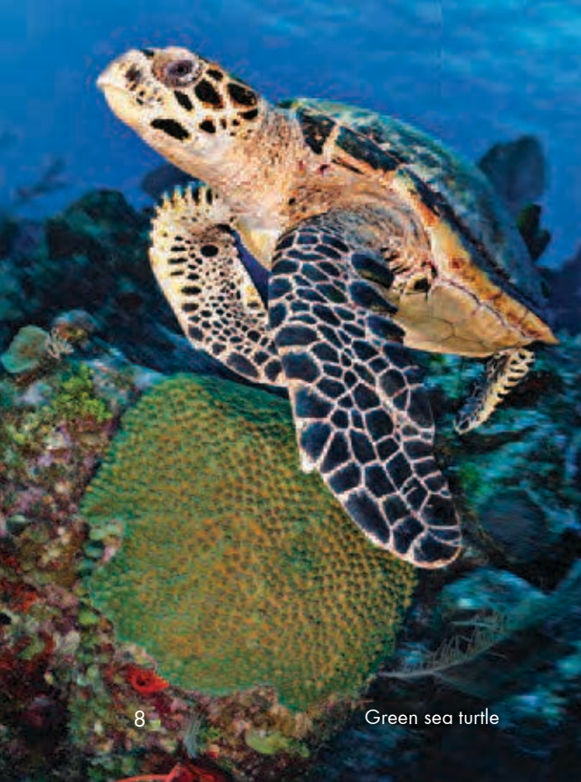
Green sea turtle

🌀 Coral reefs provide a habitat near the shore, where the water is shallow and warm. The reefs sustain over a thousand types of colorful fish as well as dolphins, turtles, sharks, and rays. There are many different kinds of corals , and they are all living organisms that can grow and change.