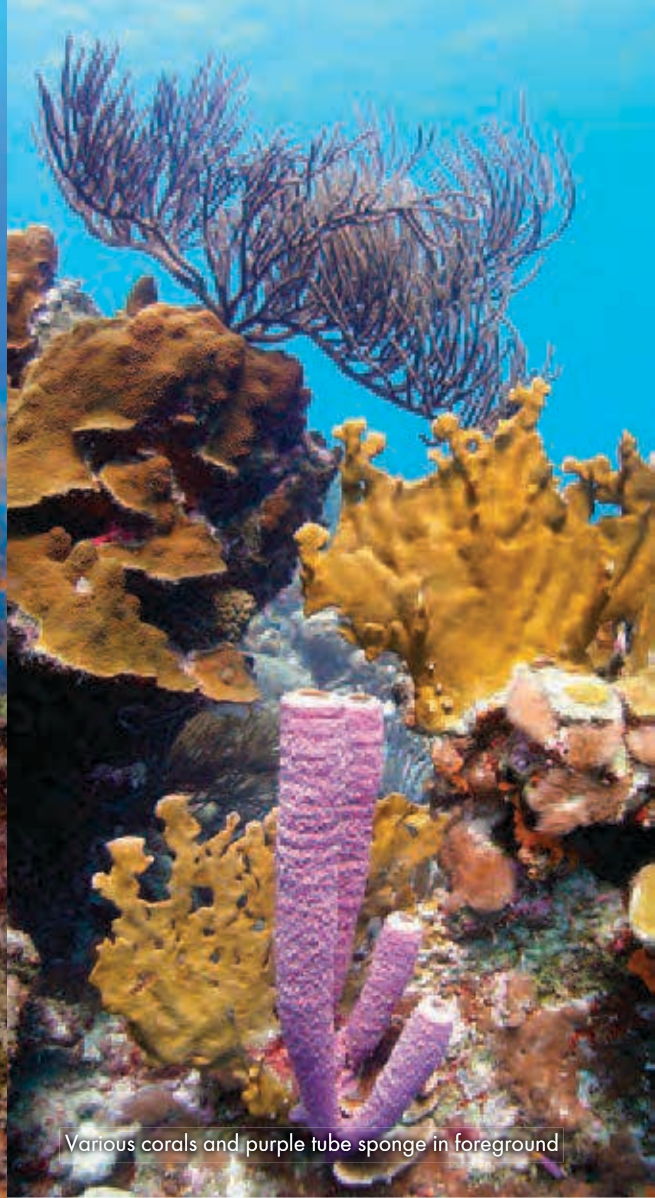
Various corals and purple tube sponge in foreground

🌀 Corals may look like plants, but they are animals.